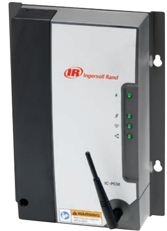
Process Communication Module